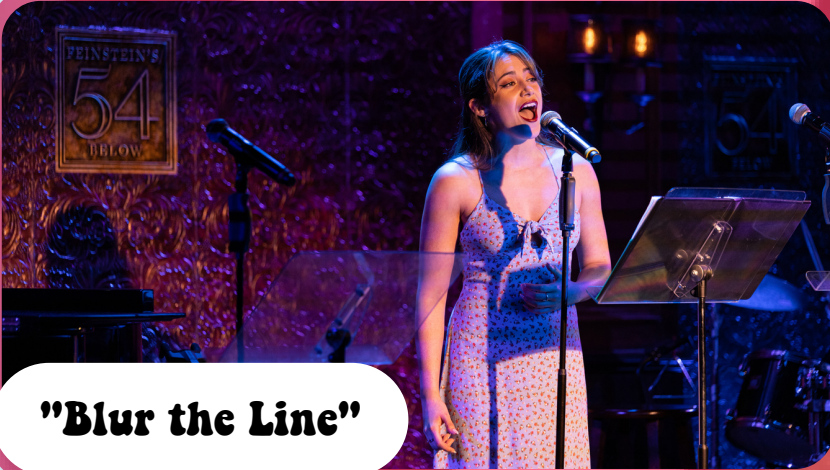
"Blur the Line"